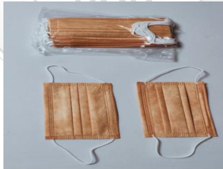
Photo of Samples

Note: Pass = Meet customer requirements; Fail = Fail customer requirements; # = No comment; N.D. = Not detected.